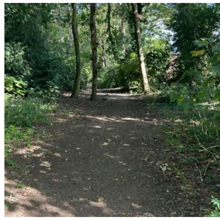
Figure 2 – Points A – B