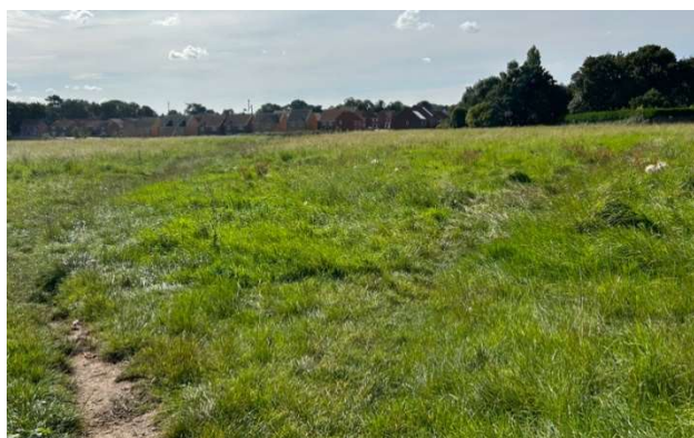
Figure 10 – F - B