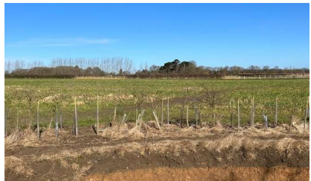
Figures 5 & 6 – Points D – E