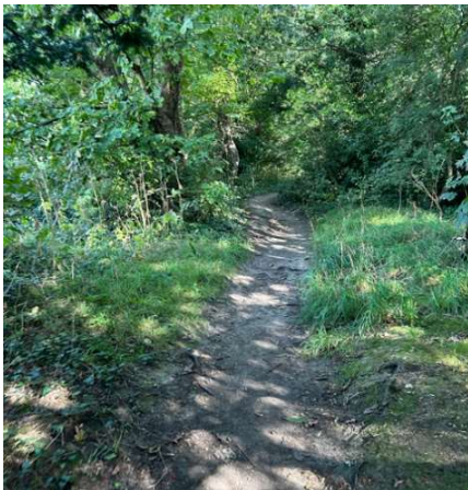
Figure 3 – Points B – C