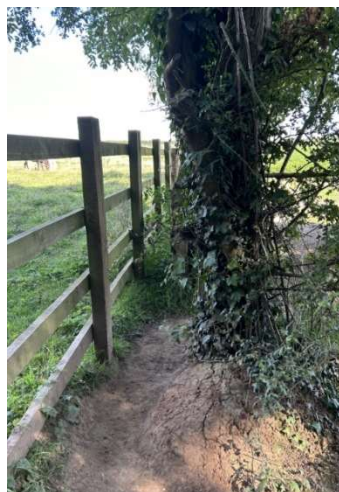
Figure 9 – Pinch point at Point F