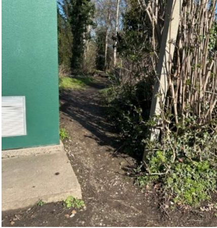
Figure 1 – Point A (pinch point)