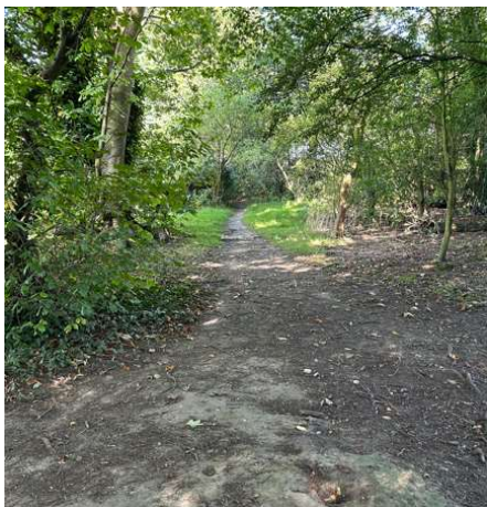
Figure 7 – Points C – F