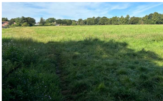
Figure 11 – B - F