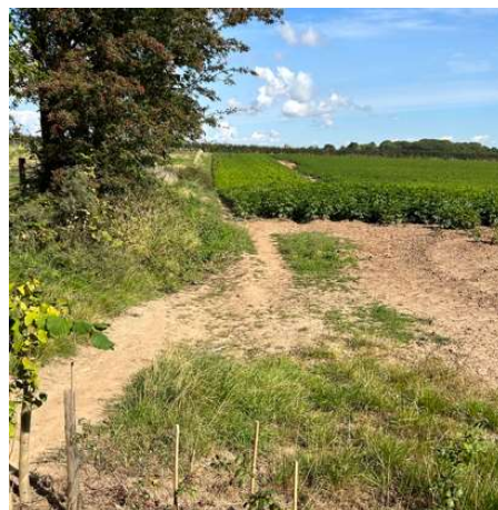
Figure 8 – Points F - G